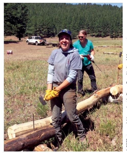
A 2022 stewardship project in Bears Ears National Monument

All told, 2022 proved to be a busy year full of both challenges and opportunities. Much of this work will continue through 2023, and we remain hopeful that BLM leadership will continue to challenge agency staff to place the conservation of wilderness-quality lands at the forefront of its planning and management decision making.