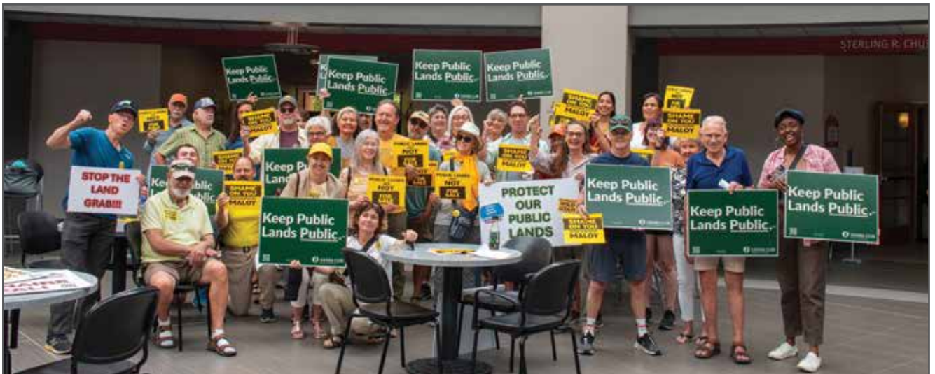
ACTIVISTS TURN OUT TO DEFEND PUBLIC LANDS AT A CONGRESSIONAL FIELD HEARING IN CEDAR CITY, UTAH.