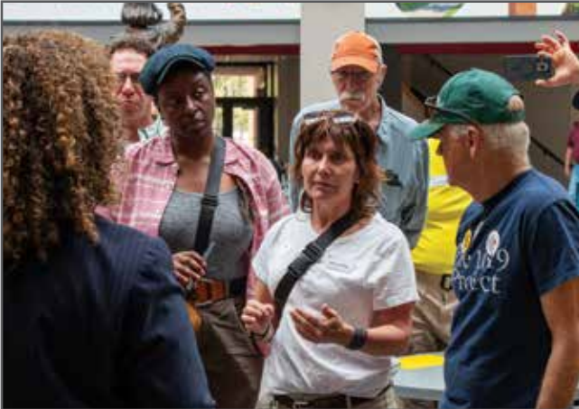
ACTIVISTS CONFRONT REP. MALOY (LEFT) AT A CONGRESSIONAL FIELD HEARING IN CEDAR CITY, UTAH TO EXPRESS OPPOSITION TO HER PUBLIC LANDS SELL-OFF AMENDMENT IN THE HOUSE BUDGET BILL.

land lovers across the country and across the political spectrum are fighting hard to get it out. We hope to be able to report good news on that front in the next newsletter.