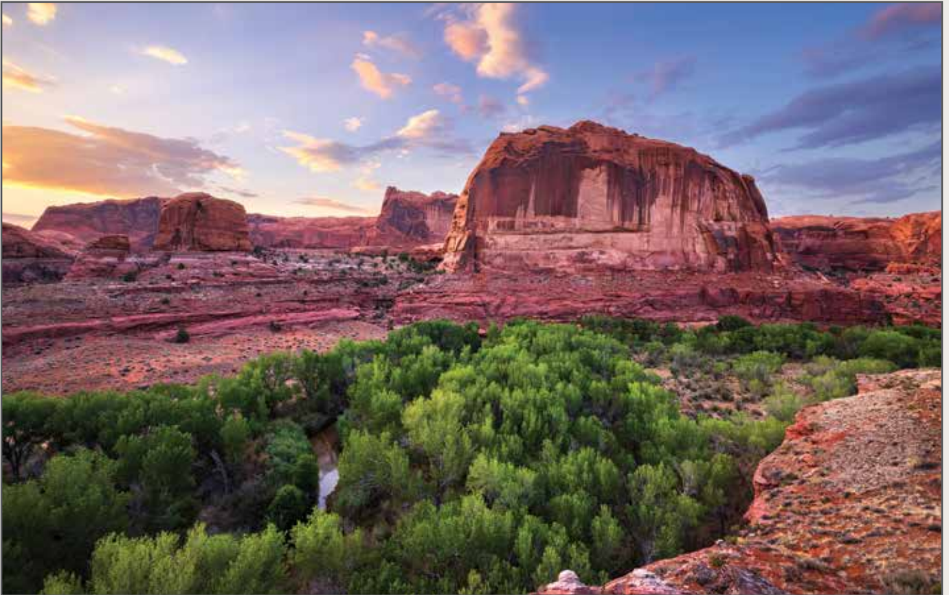
ESCALANTE RIVER.