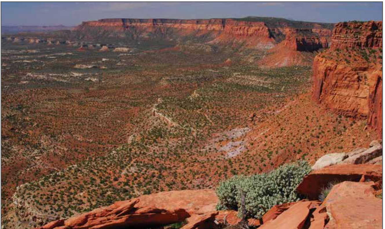
IN A DEEPLY DISAPPOINTING LOSS FOR UTAH'S WILD COUNTRY, CONGRESS HAS MADE IT MUCH MORE LIKELY THAT TREASURED PLACES IN THE GLEN CANYON REGION WILL BE IMPAIRED BY NOISY, DESTRUCTIVE ORVS.

We're incredibly disappointed with this turn of events. Rather than protect America's crown jewels, Congress has made it much more likely that treasured places in Glen Canyon and Canyonlands—such as the Orange Cliffs, Gunsight Butte, and the Maze—