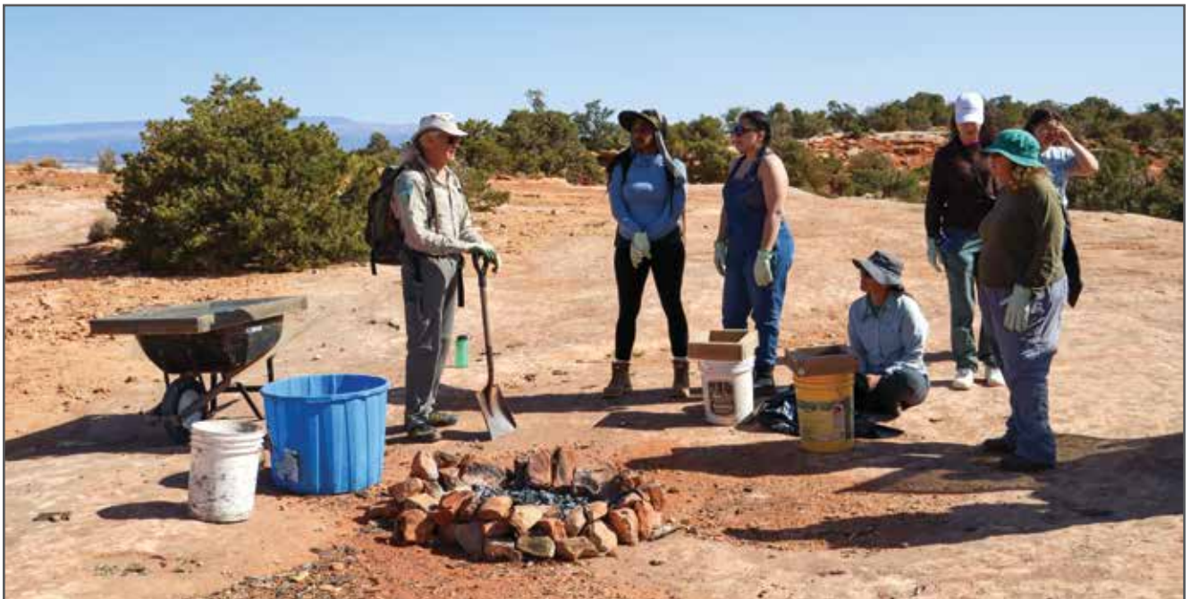
WEST LA COLLEGE STUDENTS LEARN HANDS-ON LAND PROTECTION AND RESTORATION TECHNIQUES IN GRAND STAIRCASE-ESCALANTE NATIONAL MONUMENT.