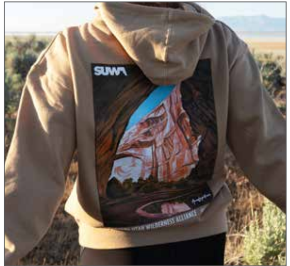
ARTWORK ON BACK OF SANDSTONE HOODIE. VIEW ALL SIZE AND COLOR OPTIONS AT SUWA.ORG/SHOP .

We're honored to collaborate with Anna on this special piece—and even more honored to protect the places that inspire art like hers. Visit suwa.org/shop to get your hoodie today! Available only while supplies last.