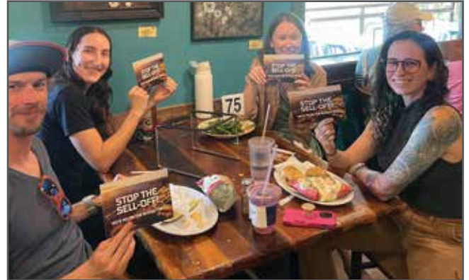
PUBLIC LAND SUPPORTERS AT A JUNE “STOP THE SELL-OFF” ACTIVIST EVENT IN LA VERKIN, UTAH.

Like many working in the nonprofit sector, much of my energy has been spent responding to the relentless attacks of the Trump administration—attacks that threaten our communities, our environment, and the very idea of a shared public good. But lately I’ve found solace in my garden. There, time slows down. I reconnect with the visible and invisible work of nature. Lessons sprout daily alongside the corn and snap peas.