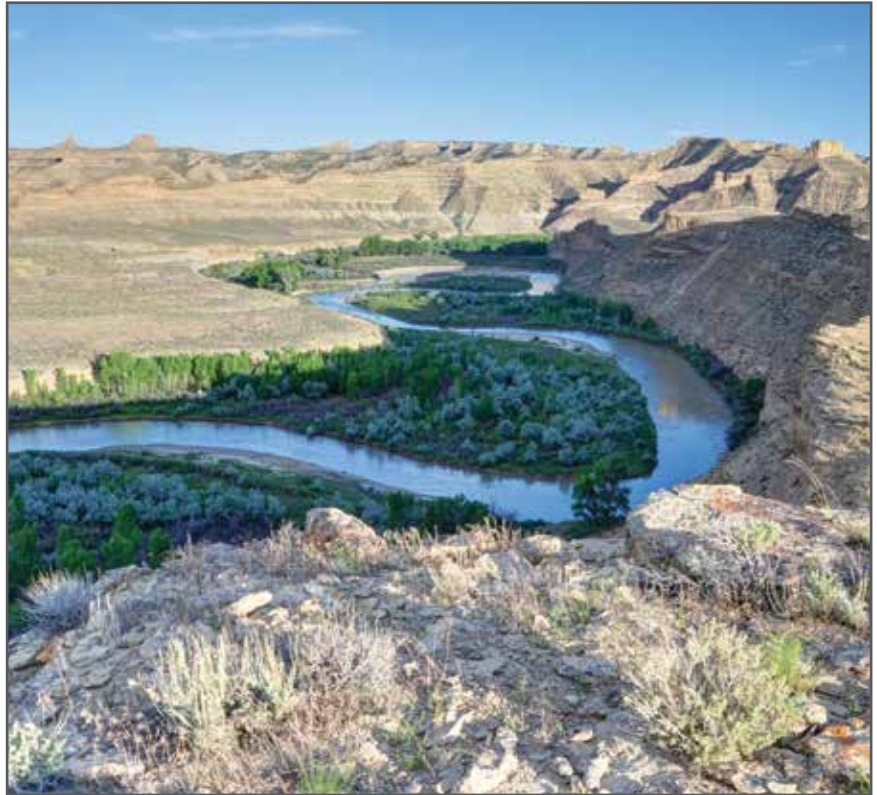
THE TRUMP ADMINISTRATION IS MOVING FORWARD WITH PLANS TO SELL 14 OIL AND GAS LEASES ENCOMPASSING OVER 19,000 ACRES IN UTAH, INCLUDING IN THE HEART OF EASTERN UTAH'S SCENIC WHITE RIVER CORRIDOR.