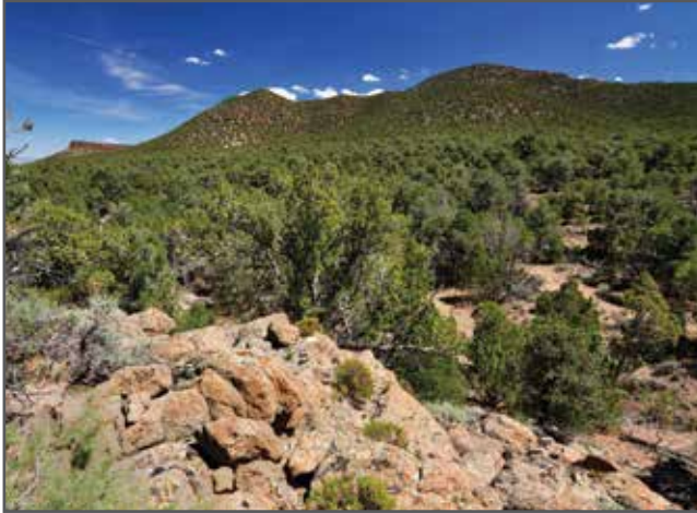
NATIVE PINYON PINE AND JUNIPER WOODLANDS COULD BE DEVASTATED IF THE “FIX OUR FORESTS ACT” IS PASSED IN ITS CURRENT FORM.

projects across millions of acres of federal land—including areas proposed for wilderness designation in America’s Red Rock Wilderness Act. The bill does this by excluding these projects from the Endangered Species Act and the National Environmental Policy Act, effectively removing science-based review and public input from the process. The House passed FOFA in January, and now a companion bill is making its way through the Senate.