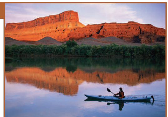
Utah's wild BLM lands provide outstanding opportunities for primitive recreation.

The ability of families to access America's public lands is well protected by America's Red Rock Wilderness Act because it ensures that the spectacular wild lands that exist today will still exist tomorrow. Under the Act, these scenic gems would be preserved in their natural state, providing opportunities for primitive recreation such as camping, hiking, canyoneering, hunting, fishing, river running, and horseback riding. An extensive network of routes would still be available for the 10 percent of visitors who participate in motorized recreation, and the proposed wilderness boundaries have been drawn so that popular bicycle trails such as the Slickrock Bike Trail near Moab would remain open to riders.