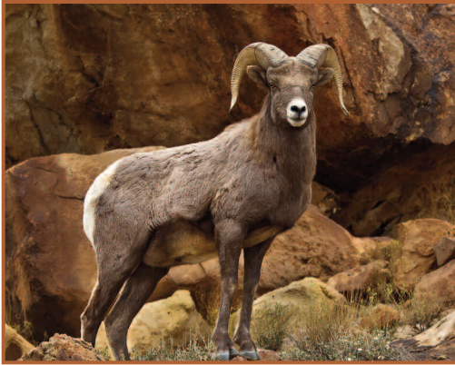
Desert bighorn sheep.

Utah's diverse landscape of rivers, rocky cliffs, sand dunes, grasslands, and forests shelters at least two dozen endangered or sensitive species, including unique relict plant communities and a large number of plants found nowhere else in the world. Wilderness designation helps protect these "at risk" species as well as animals that are sensitive to human disturbance. Many birds and mammals found in wilderness are intolerant of excessive human intrusion, especially during nesting, birthing, and denning times. Federal protection of Utah's remaining BLM wilderness can play a crucial role in safeguarding sensitive species and preserving Utah's unique biological heritage.