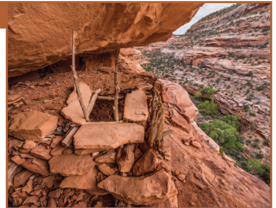
Utah's wilderness lands shelter a treasure trove of prehistoric artifacts and cultural sites.

The Colorado Plateau contains one of the greatest concentrations of ancient cliff dwellings, granaries, and rock art in the world. According to the Utah Professional Archaeological Council, which endorsed America's Red Rock Wilderness Act in 1995, "maintaining roadless areas is the largest and least costly deterrent to pothunting, inadvertent driving over sites, and vandalism." Last year, leaders from the Hopi Tribe, Navajo Nation, Ute Mountain Ute Tribe, Pueblo of Zuni, and Ute Indian Tribe successfully led a campaign to proclaim the Bears Ears cultural landscape as a national monument. Designated by President Barack Obama on December 28, 2016, the 1.35 million-acre Bears Ears National Monument contains approximately 983,537 acres of proposed wilderness included in America's Red Rock Wilderness Act.