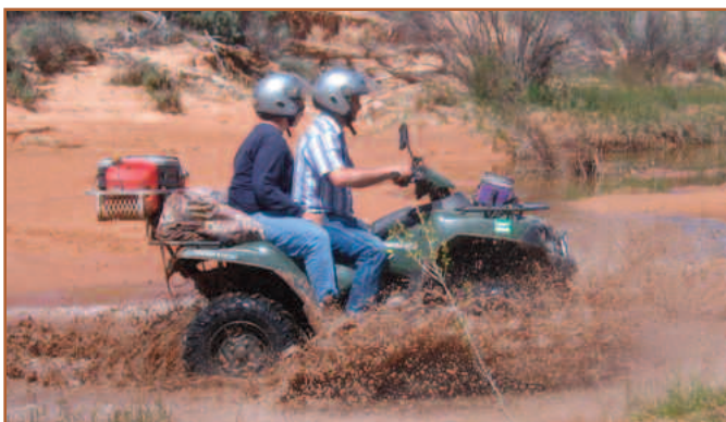
ORV use fragments wildlife habitat and degrades desert streams.

Off-road vehicle (ORV) use in Utah's canyon country is one of the most pervasive threats to this landscape. ORV use fragments wildlife habitat and degrades scarce desert streams, muddying and polluting water that is critical to the survival of over 80 percent of the area's wildlife species. Research also shows that ancient archaeological artifacts, including masonry room blocks, granaries, and rock art, are more likely to be vandalized or looted if an ORV route is located nearby. When the Bush administration finalized travel plans for public lands in eastern and southern Utah, it blanketed the area with over 20,000 miles of ORV routes—including 3,000 miles of routes in proposed wilderness (much of it recognized as wilderness-quality by the BLM itself). Many of these are nothing more than faded mining tracks, wildlife trails, streambeds, and canyon bottoms. Closing just a fraction of these unnecessary routes would preserve wilderness resources until Congress has a chance to permanently protect them through federal wilderness designation.