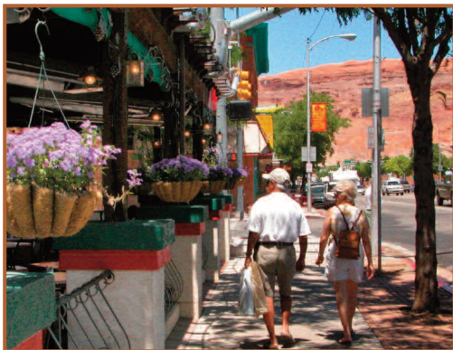
Tourists in Moab.

Outdoor recreation ranks with financial services and healthcare as one of the three largest sectors of America's economy according to the Western Governors Association. An Outdoor Industry Association study found that outdoor recreation generates $12 billion per year in consumer spending in Utah and accounts for 122,000 jobs in the state. Ninety-two businesses including major outdoor equipment manufacturers and retailers, bed and breakfast and restaurant owners, guides and artists currently support America's Red Rock Wilderness Act because it protects the backcountry and thereby preserves the foundation of the regional economy.