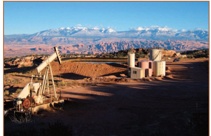
Oil and gas development mars the landscape just six miles from the boundary of Canyonlands National Park.