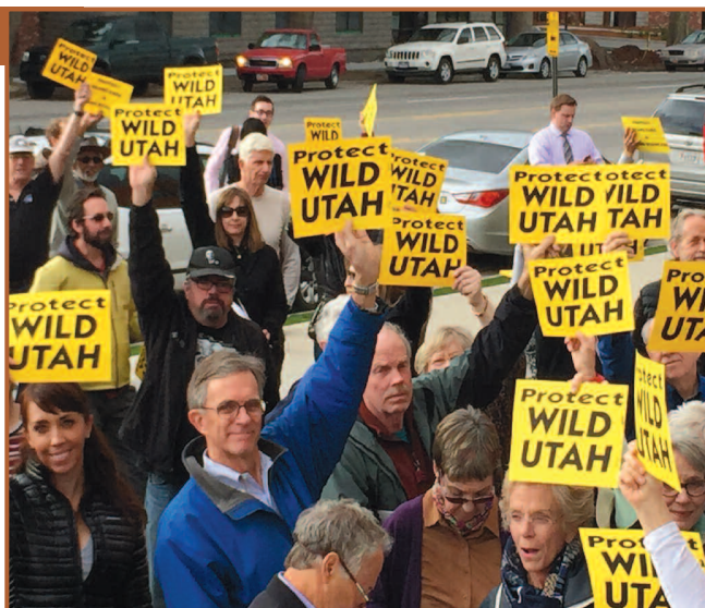
Citizen activists continue to call for the protection of America's Red Rock Wilderness at congressional town halls, at the Utah State Capitol, and in Washington, DC.