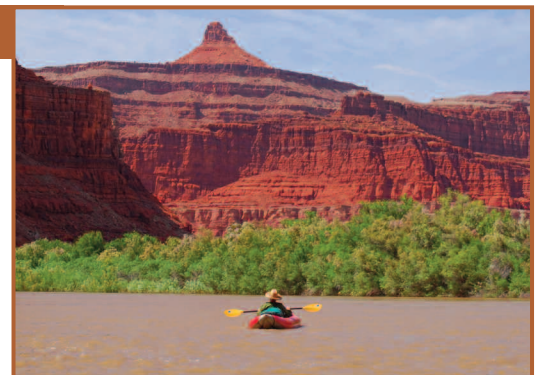
Utah's wild BLM lands provide outstanding opportunities for primitive recreation.

The ability of families to access America's public lands is well protected by America's Red Rock Wilderness Act because it ensures that the spectacular wild lands that exist today will still exist tomorrow. Under the Act, these scenic gems would be preserved in their natural state, providing opportunities for primitive recreation such as camping, hiking, canyoneering, hunting, fishing, river running, and horseback riding. An extensive network of routes would still be available for the 10 percent of visitors who participate in motorized recreation, and the proposed wilderness boundaries have been drawn so that popular bicycle trails such as the Slickrock Bike Trail near Moab would remain open to riders.