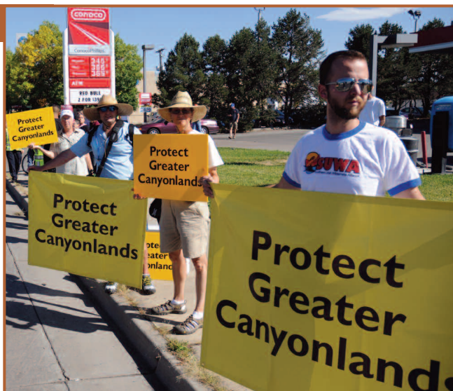
Activists in Denver show their support for protecting Utah's Greater Canyonlands Region as President Obama's motorcade drives by.