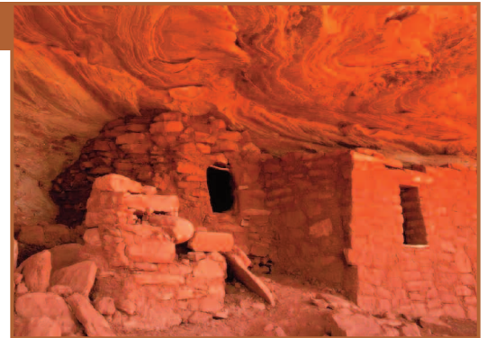
Utah's wilderness lands shelter a treasure trove of prehistoric artifacts and cultural sites.

The Colorado Plateau contains one of the greatest concentrations of ancient cliff dwellings, granaries, and rock art in the world. America's Red Rock Wilderness Act would preserve much of Utah's prehistoric artifacts from damaging development while decreasing the risks of vandalism and looting. The Utah Professional Archaeological Council endorsed America's Red Rock Wilderness Act in 1995. According to the council, "... maintaining roadless areas is the largest and least costly deterrent to pothunting, inadvertent driving over sites, and vandalism." Representatives from the Hopi Tribe and the Navajo Tribe have urged the BLM to protect places of special significance included in America's Red Rock Wilderness Act.