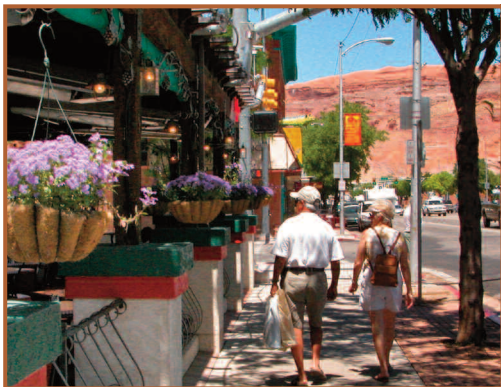
The outdoor industry contributes over $6 billion annually to Utah's economy.

Outdoor recreation ranks with financial services and healthcare as one of the three largest sectors of America's economy according to the Western Governors Association. A Grand County, Utah report found this was by far the largest sector of the local economy, providing 44 percent of non-government jobs in the area. The business community understands that wild and beautiful landscapes are essential to the local economy and draw a wealth of commerce to rural Utah. Ninety-two businesses including major outdoor equipment manufacturers and retailers, bed and breakfast and restaurant owners, guides and artists currently support America's Red Rock Wilderness Act because it protects the backcountry and thereby preserves the foundation of the regional economy.